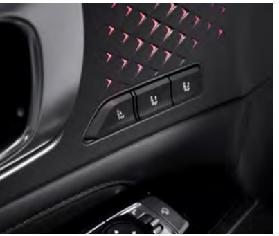
Integrated Memory System