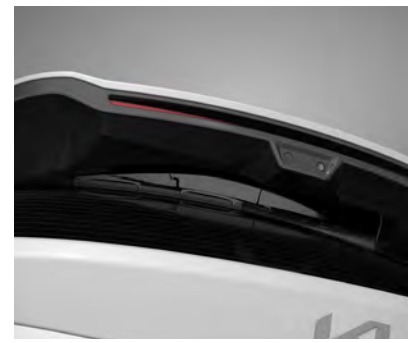
Hidden rear wiper