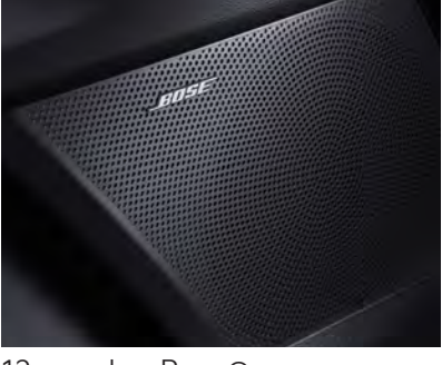
12-speaker Bose® premium sound system