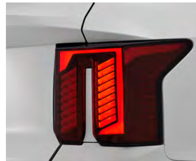
LED rear combination lamps