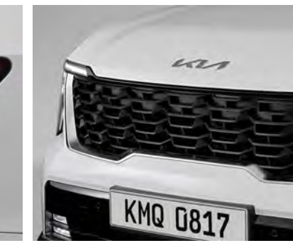
Matte black radiator grille