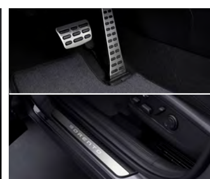
Metal pedals / Door scuff