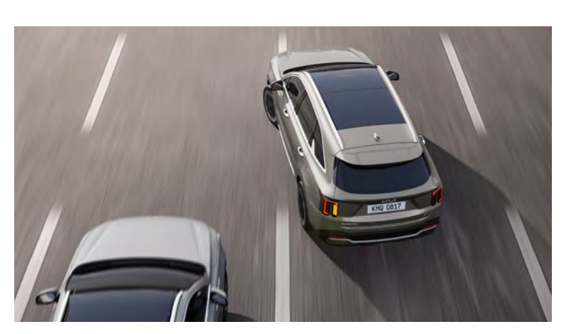
Blind-Spot Collision-Avoidance Assist (BCA) warns you if there is a risk of collision with a rear side vehicle in the blind-spot while changing lanes. When forward exiting a parallel-parking spot, it automatically assists with emergency braking if a risk of collision with a vehicle approaching from behind is detected.

Smart Cruise Control (SCC, depicted above) helps you maintain a safe distance from the vehicle ahead at the speed you set. If the vehicle ahead stops abruptly, the Sorento automatically stops and then resumes acceleration.