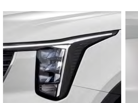
MFR LED headlamps