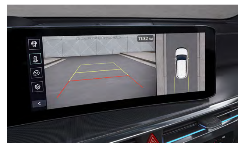
Surround View Monitor (SVM) displays a variety of views of the situation around the vehicle for safe parking.

Forward Collision-Avoidance Assist (FCA 2) monitors your surroundings and warns you if it detects a risk of collision with a vehicle, pedestrian or cyclist ahead. If the risk persists, it automatically assists with emergency braking. FCA 2 also assists with emergency braking if it senses a risk of collision with oncoming vehicles while turning left at an intersection, or with vehicles approaching from left or right. When changing lanes, automatic avoidance steering assistance is engaged if there is a risk of collision with an oncoming vehicle in the next lane, a cyclist or pedestrian in the intended path, or an approaching rear-side vehicle.