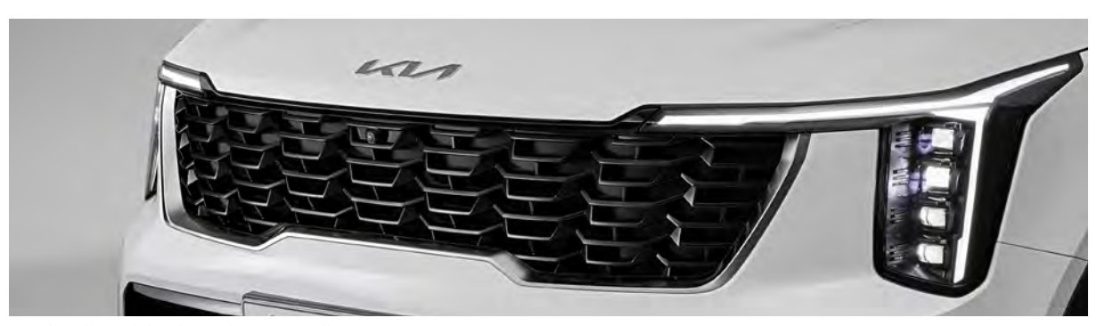
High gloss black radiator grille