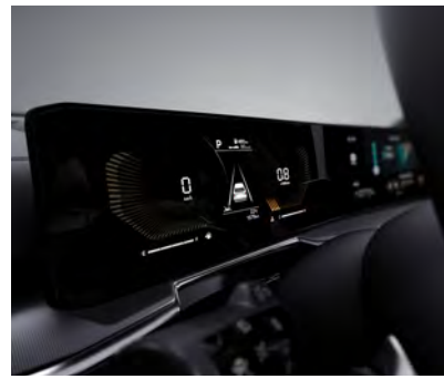
Supervision cluster (4.2" color TFT LCD)