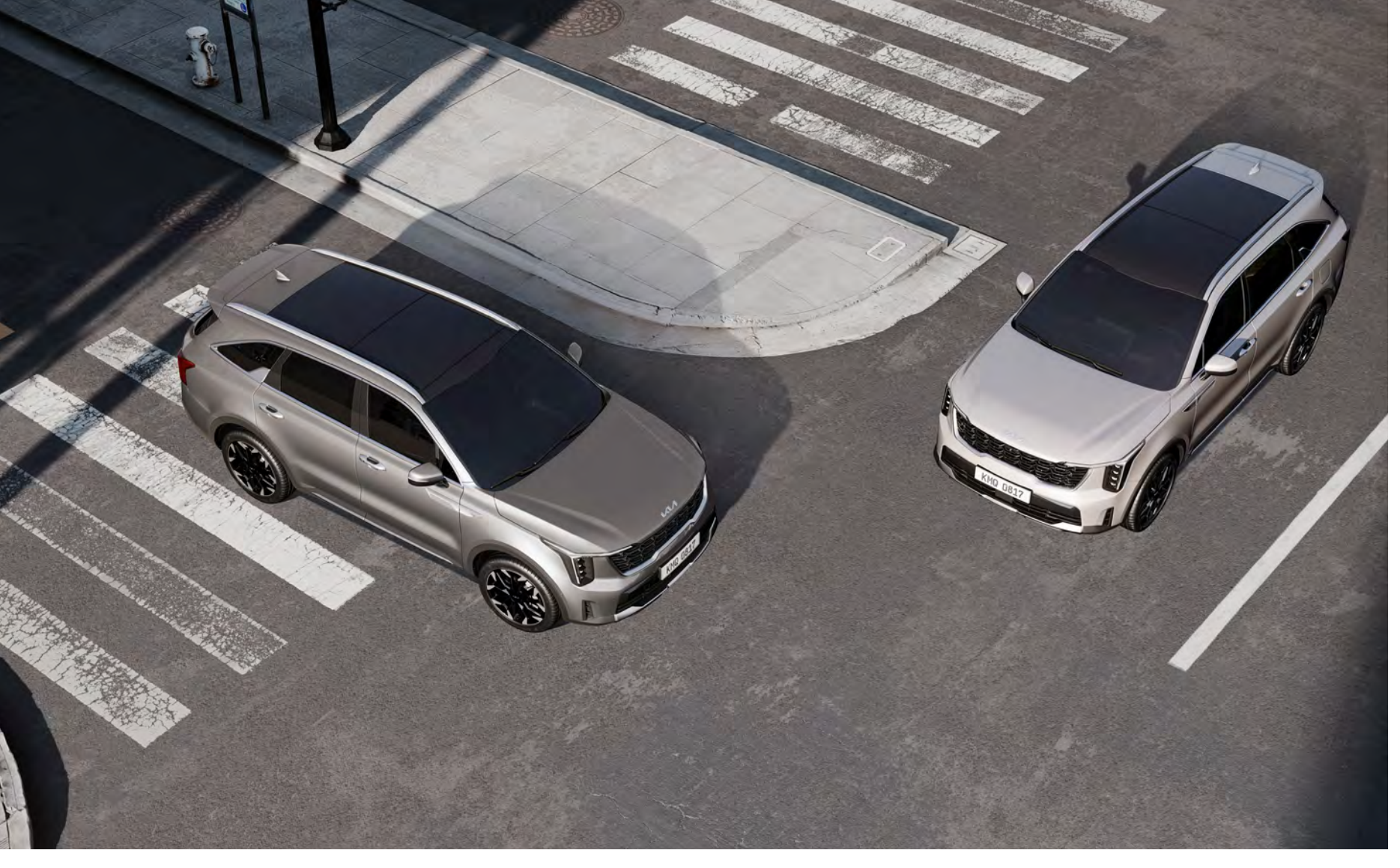
Reverse Parking Collision-Avoidance Assist (PCA) provides a warning if there is a risk of collision with a rear object while reversing. It automatically assists with emergency braking if the risk of collision increases after the warning.