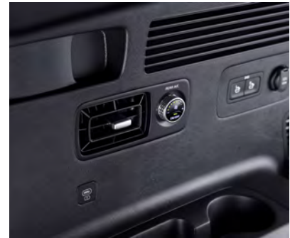
3rd row air conditioning system