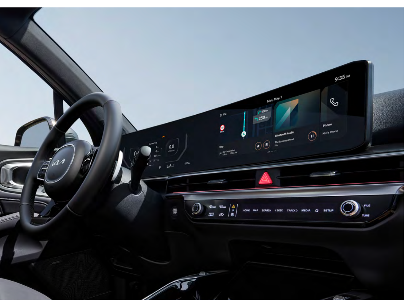
Panoramic Curved Display

Technology sometimes does more for us when we're barely aware of it. The Sorento's horizontally oriented driver interface organizes more functions in a tastefully contained, easy-to-understand way. The look is simple, but the brainpower runs deep.