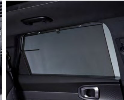
Rear side-window sunshades