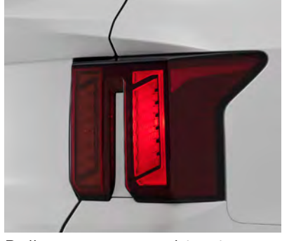
Bulb-type rear combination lamps