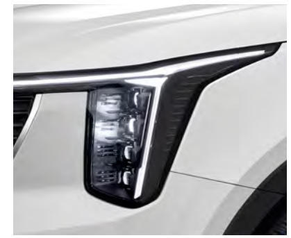
Projection LED headlamps