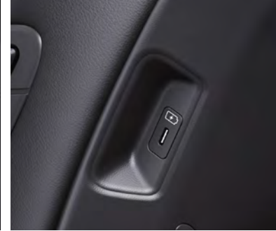
Seatback USB chargers