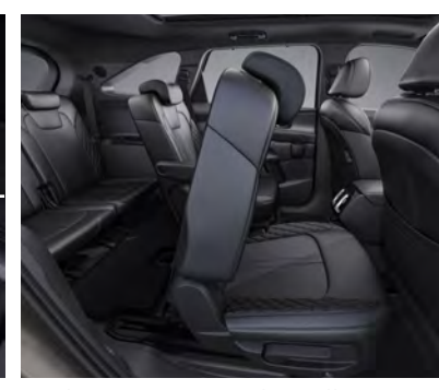
2nd row one-touch walk-in system